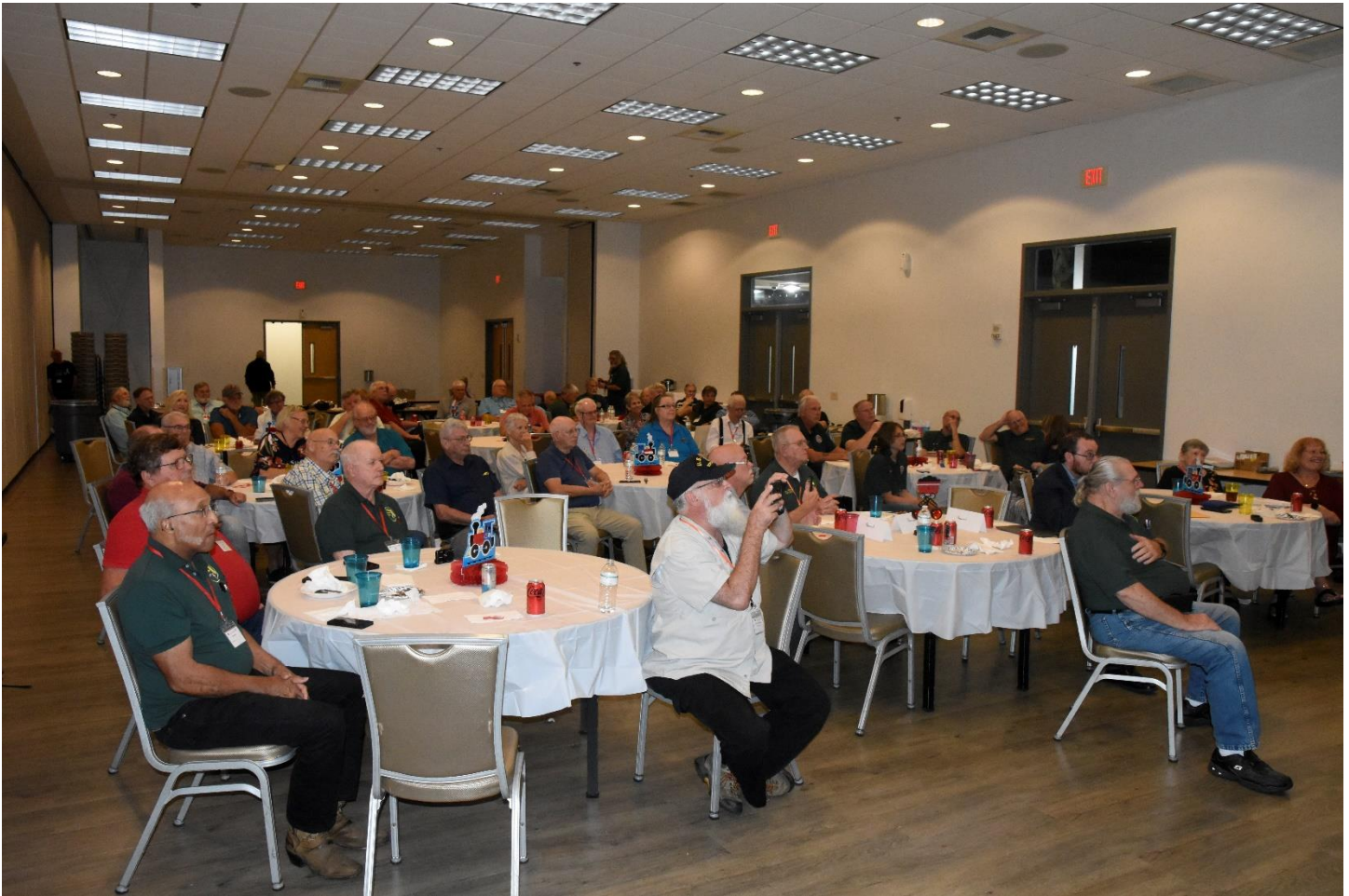
(Left to Right) 2023 SSR Convention Banquet attendees