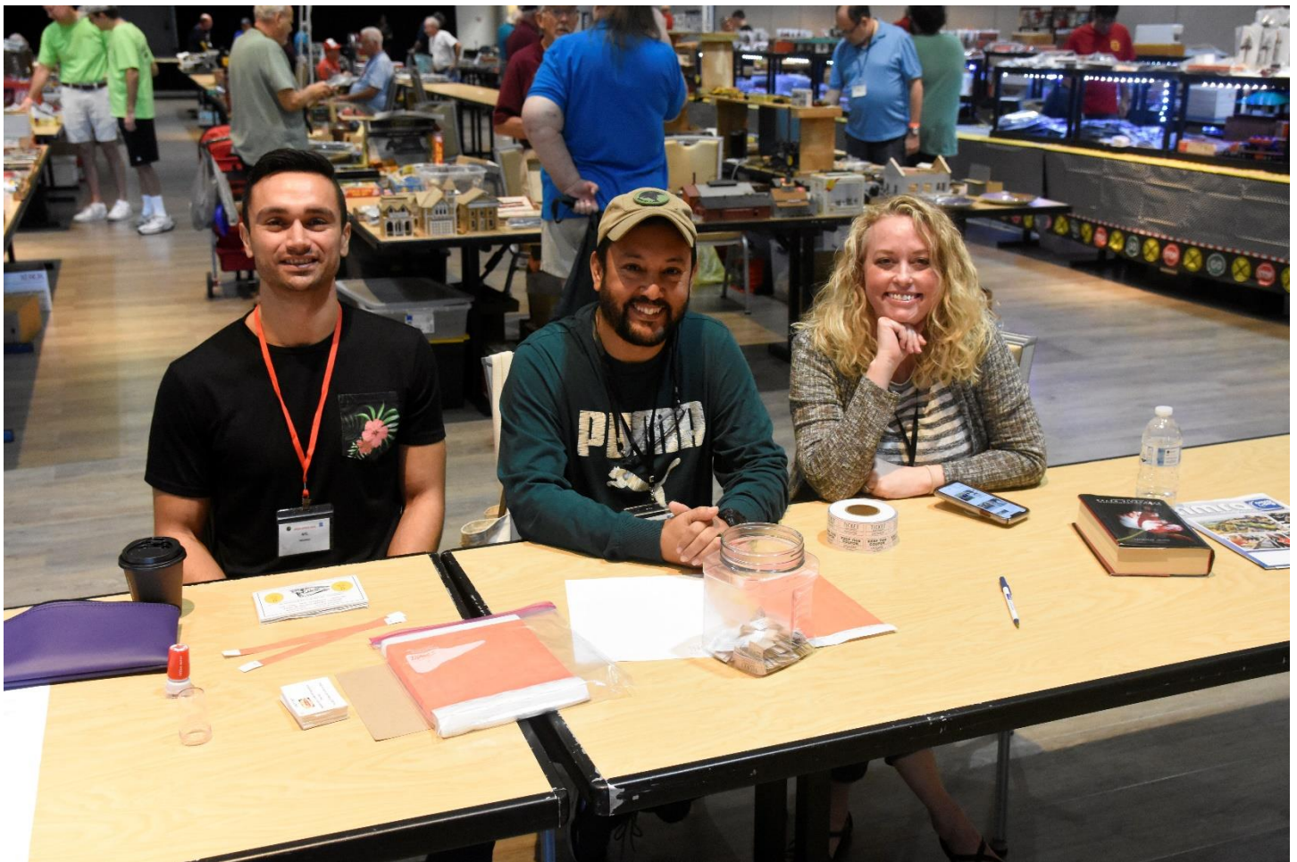
NEW YORK LIFE VOLUNTEERS !