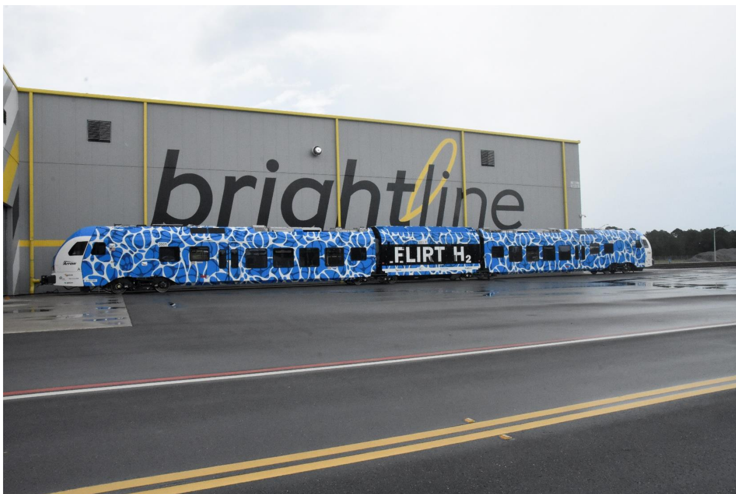
Hydrogen Powered Test Train from California.