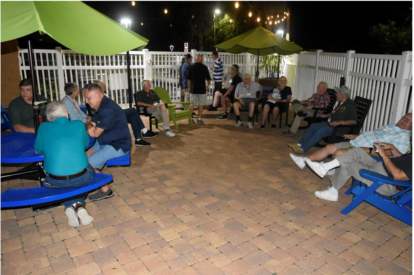
Friday Night Ice Cream Social