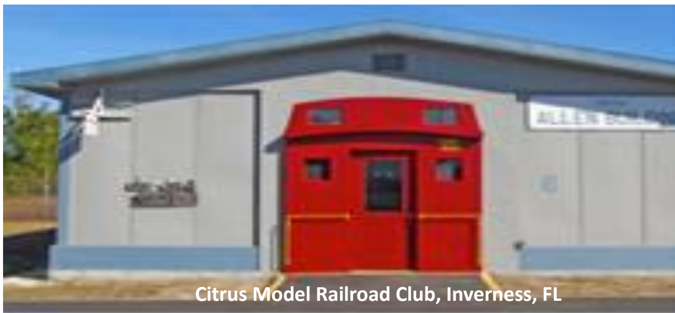
Citrus Model Railroad Club, Inverness, FL