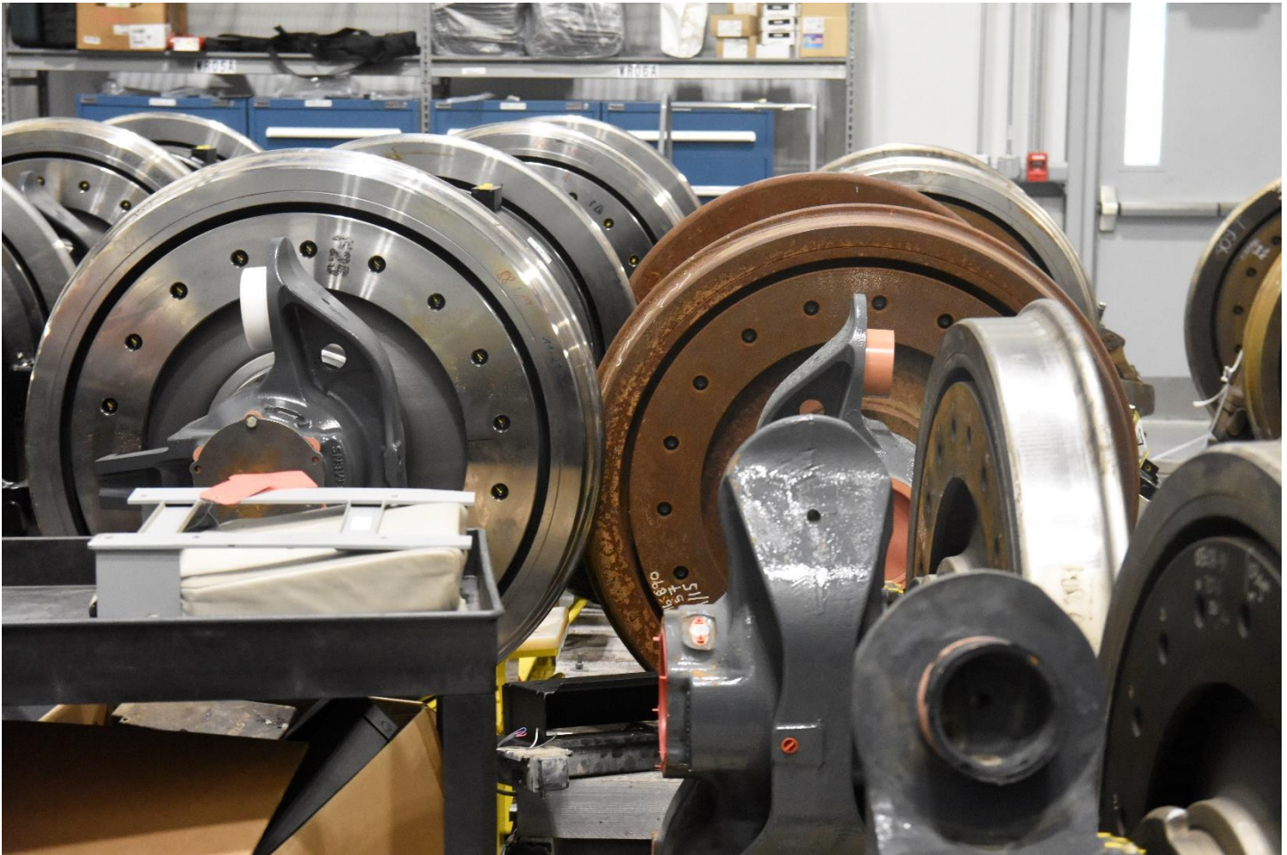
Brightline Base Camp Tour picture of Brightline Wheel Sets