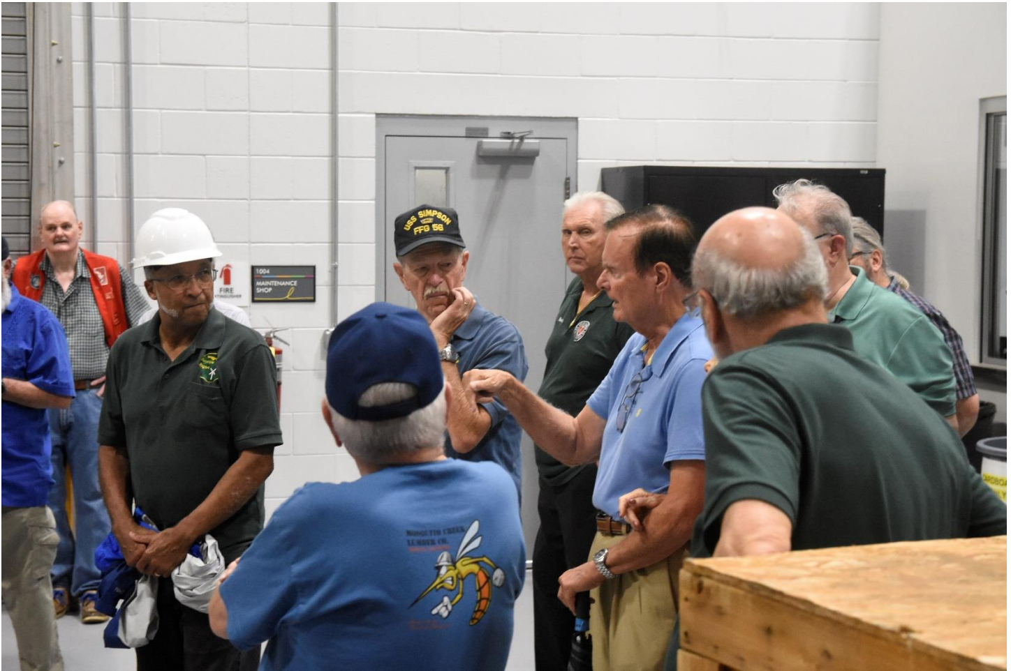
Brightline Base Camp Tour attendees' discussion