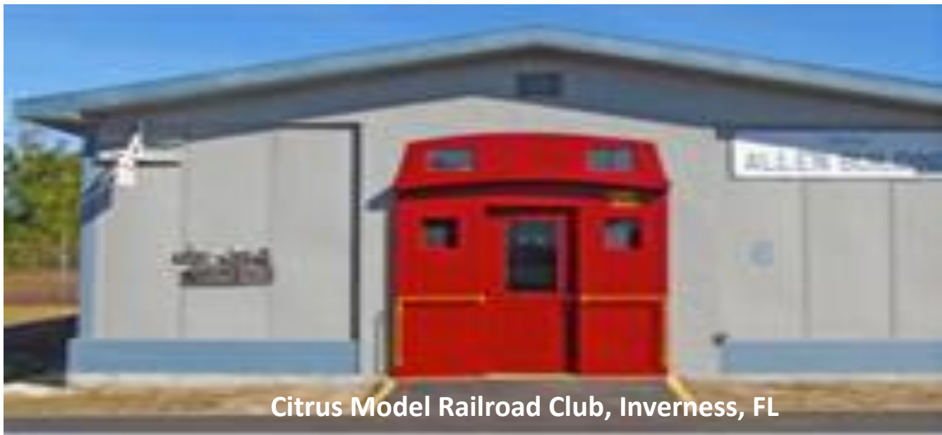
Citrus Model Railroad Club, Inverness, FL