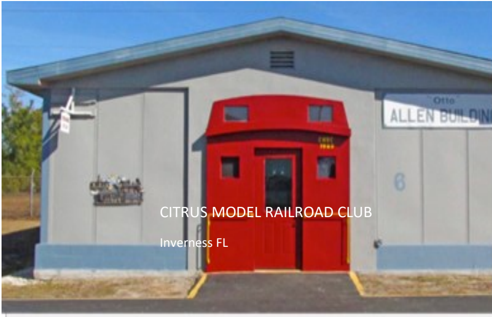
CITRUS MODEL RAILROAD CLUB Inverness FL